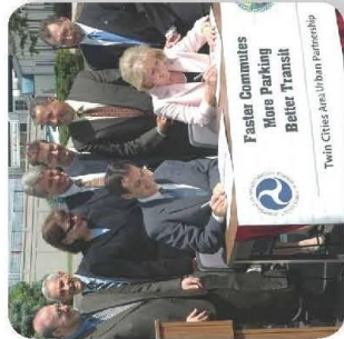
Figure 12-2: The UPA is one example of congestion management.

This Policy Plan sets a new direction and vision for the expenditure of funds on the Metropolitan Highway System emphasizing ATM applications, lower-cost / high-benefit projects and the implementation of managed lanes system-wide. It emphasizes that investments on the non-freeway trunk highway system sought by local entities should also be consistent with the policy direction of this plan. However, the Regional Solicitation for highway projects to date has to a large degree emphasized funding for expansion. This policy direction should be revisited to ensure that, in accordance with this plan and federal policy, adequate preservation investments are being made on the federally eligible highway system. The Transit chapter also emphasizes system preservation as the top priority, with additional revenue (when available) used to expand the bus system and grow the system of bus and rail